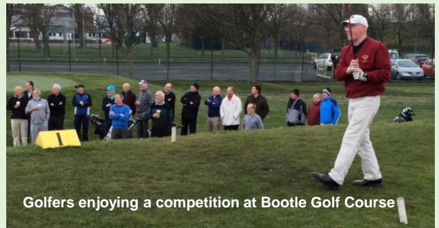
Golfers enjoying a competition at Bootle Golf Course

Both golf courses continue to be maintained to a high standard within the resources available, which is a credit to the greenkeepers and artisan volunteers.